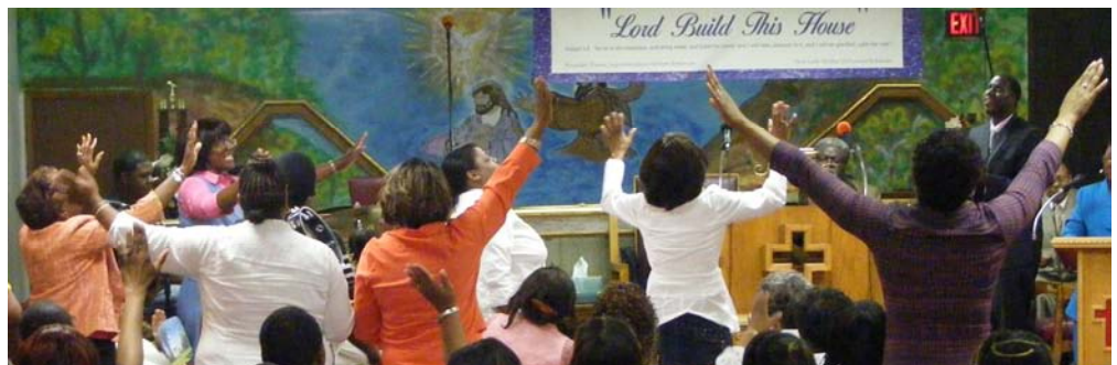
Saints Praising The Lord at the My Convention

to testify to the “Courage,” and “Confidence” that God have given her. It was a blessing to witness this once timid person grow and become the amazing woman of God that she is today. She serves as a leader and an excellent role model to God’s most precious people, our youth.