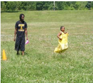
Yearly Sack Race

Good Samaritan hosted it's 21st Annual Church Picnic at Klutchez Park in July. There was food and games. As the park filled with church family and friends, the day seemed to get better and better. There couldn't have been a better day to be around the people you love. Good Samaritan has made it a tradition to have a baking contest every year. It is a requirement that the contestants bake from scratch. The winner this year was